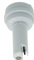
pH + Conductivity + Temperature 3-in-1 electrode