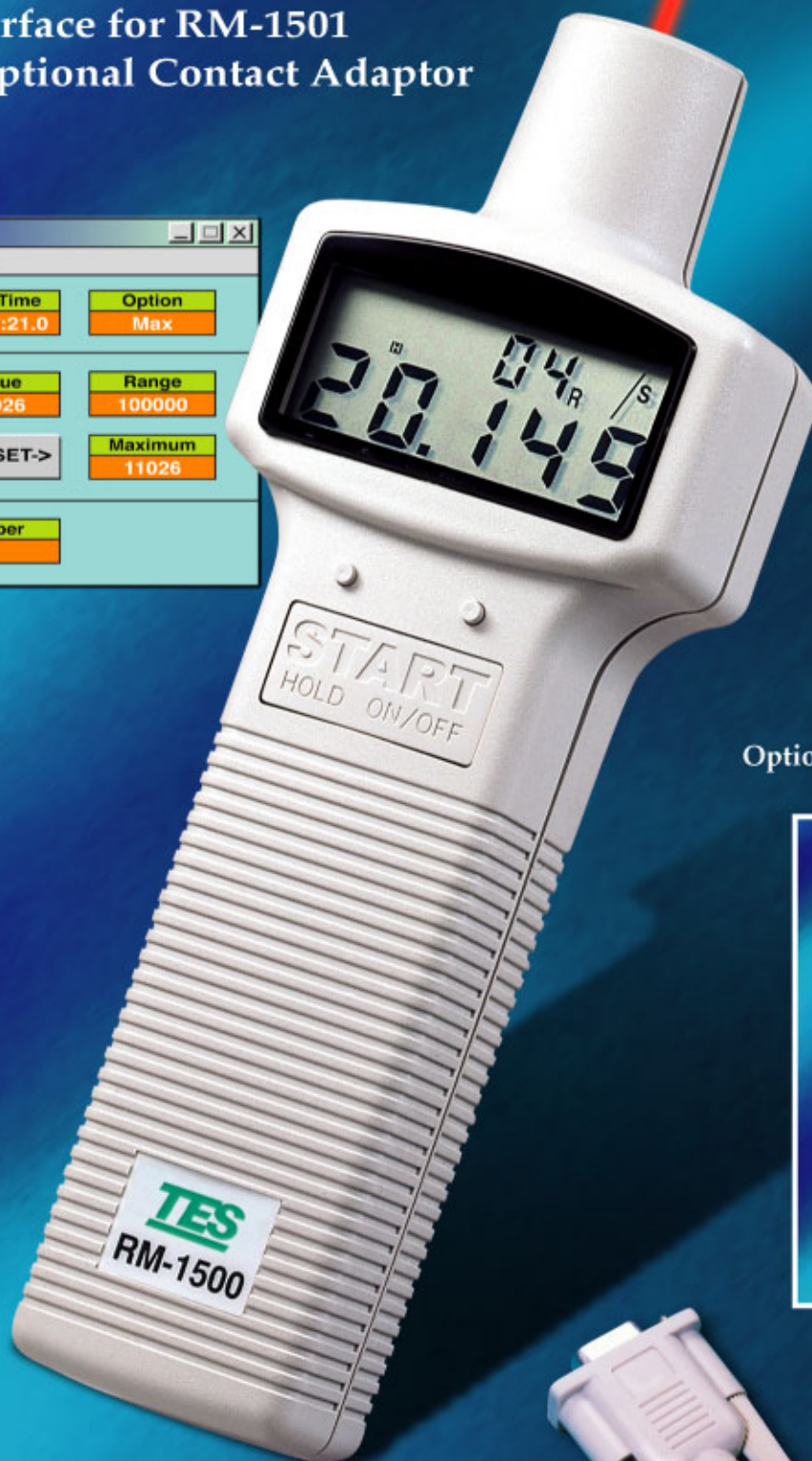
Optional Contact Adaptor RM-1502