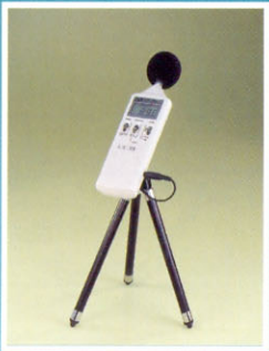
Wind Screen/ Tripod Stand